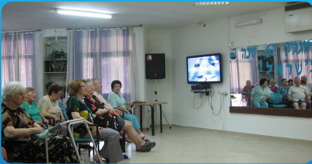
HELPING THEM AGE WITH DIGNITY